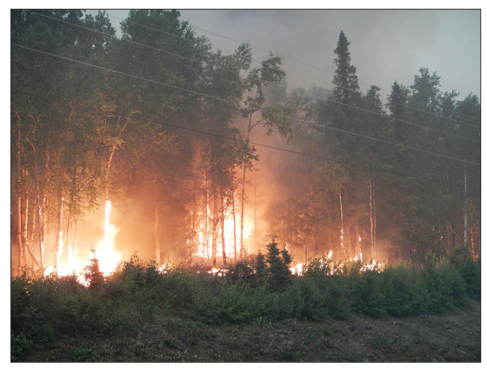
Figure 1: Wildfire on a DOD Training Range in Alaska