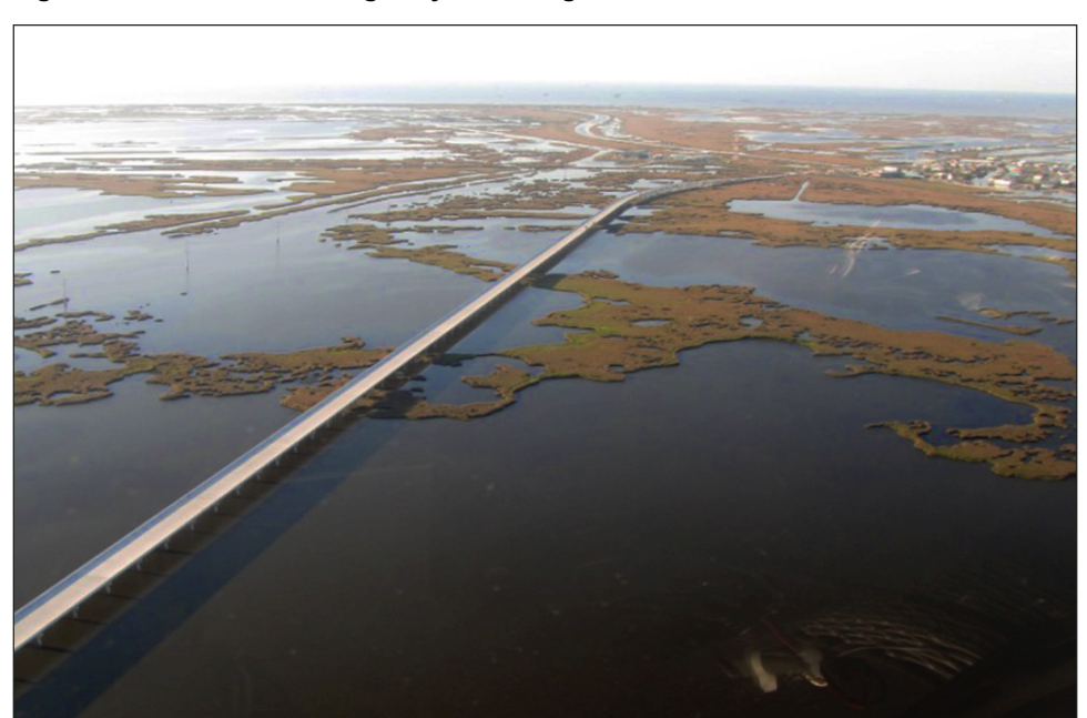
Figure 4: Louisiana State Highway 1 Leading to Port Fourchon

the national gross domestic product by about $7.8 billion.<sup>23</sup> Figure 4 shows Louisiana State Highway 1 leading to Port Fourchon.